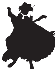
FRIVOLOUS-SW 60 x 75 cm - 2,8 kg