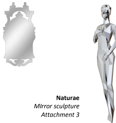
Naturae Mirror sculpture Attachment 3